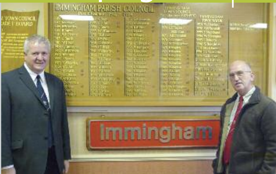
You're never far from the railway in Immingham – this is the sign in the council chamber

block to complain about the number of lorries going through our town. People do care. They just don't know how to express it.'