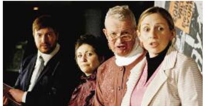
The cast at the TUC production