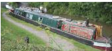
Drama on the road ... well, the canal

To make it accessible, the company has taken its productions out on the road - or, more often, the canal. 'Apart from venues like the TUC, where Deborah saw us, we've toured the national waterway system on our Grand Union narrowboat, Tyseley, in search of our audiences. We've performed at canal and