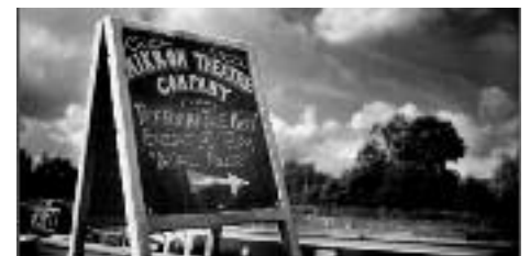
A bleak future for shows if funding isn't found

says. 'But if we don't get some formal backing we may have to sell our narrowboat, which would be a real blow.'