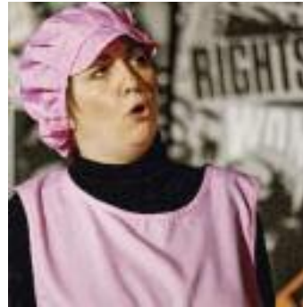
A travelling theatre with a theme of working rights

wants to go back to work and now that it is illegal for employers to discriminate against married women she approaches her old boss at the bakery. Bakery owner Mr Winner is shocked to find that he now has to abide by the Equal Pay Act.