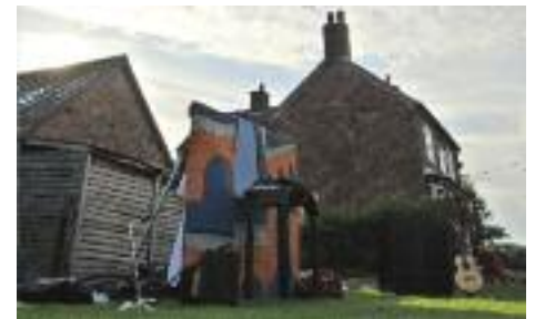
All the land's a stage for the travelling Mikrons