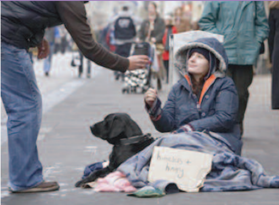
ASLEF's Women's Representative Committee have adopted the Street Talk charity which takes mental health care on to the streets to homeless women who do not have access to health care