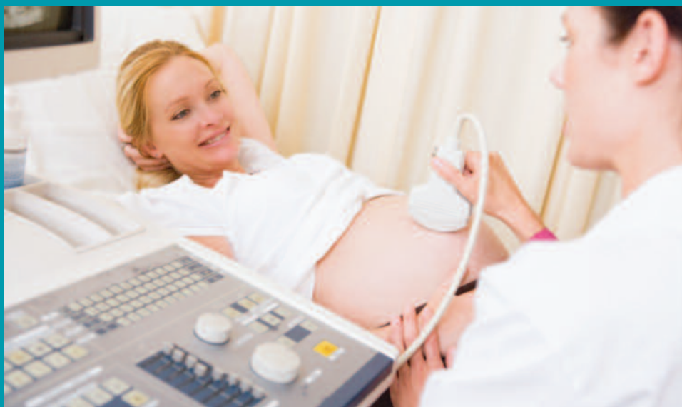
Although maternity leave is statutory, some employers are reluctant to provide adequate time off for fertility treatment.

If you are in this situation and need support and advise in the first instance you should contact your local rep who can help when dealing with management and HR locally. You can also contact the WRC member for your district.