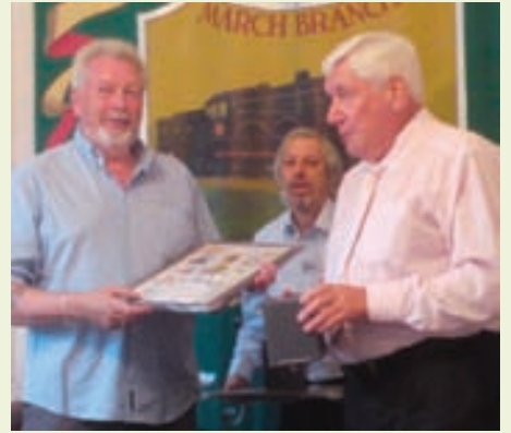
The GS does the honours at East Finchley