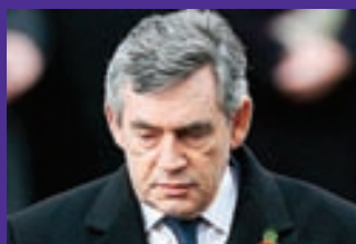
Gordon Brown attended Commemoration