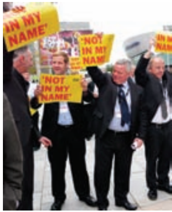
ASLEF's delegation gets ready for the vigil

... WHILE RAIL MINISTERS GO! Transport campaigners meeting informally outside conference