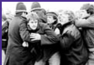
ASLEF supported miners' strike