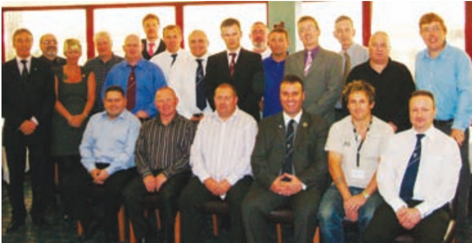
LIVERPOOL SAFETY SEMINAR: 17 reps turned out for this important seminar