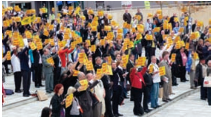
VIGIL: an impressive sight as TUC delegates reflect on the victims of hate crime and ponder how to combat it in the future

calculated that since Labour was elected in 1997, we have had to deal with no less than 34 government ministers for transport. Small wonder that ASLEF has often accused the government of lacking a long-term strategic overview!